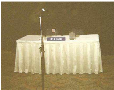
IAHA's Empty Delegate Table