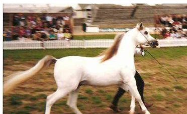
One of the stallions shown during the presentation of Australian Champions at the Brisbane Show Grounds

level to swiftly moving into an era of "global" community of sales and competitions for our horses. (Gads, not only our horses, but our everyday life.) It is happening very quickly and I look to see international exchanges become as commonplace in the near future as is the fact that today we exchange horses and attend competitions over state lines as every-day occurrences, but that was very rarely done just 40 years ago. One of the offspring from a stallion I raised and sold went to Dubai to compete in the international endurance ride held there in 1998. I have since received many inquiries from around the world about my own breeding program and horses I have bred that are for sale. And here I sit out in the middle of the northern Mojave desert in California, a small breeder. But the world found me anyway. IAHA needs to be able to provide accessibility to all Arabian horses around the world to IAHA competitions. This will bring people from all around the world to our most visible market place, the show ring. On the other hand, encouraging and integrating these people and horses into our competitions exposes our horses to the world and will, I am sure, lead to more and more of our US horses not only going on to international competitions but also to previously unavailable exposure for selling our horses (shipped semen, etc.) to international markets. We have to be compatible with PAHR to do this.