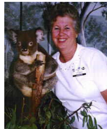
Lorry with delightful Koala

Lorry's View of Gold Coast Beaches from 28 th Floor