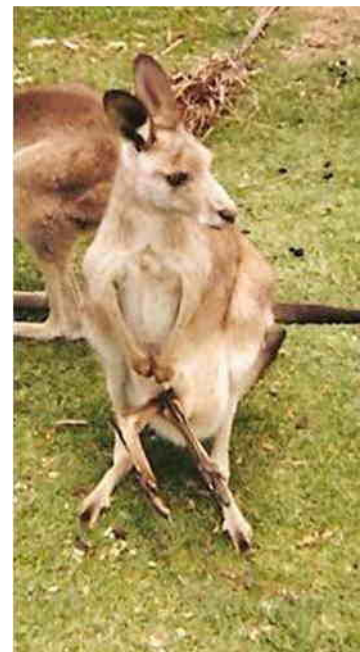
Charming Australian kangaroo with "little roo" peeking from her pouch!

One of the "unwritten" rules, so-to-speak, is that no attendee, whether delegate or observer, is here for "commercial or self-serving" purposes. There is no promotion of stallions, ranches, etc. The conference is based on discussion and resolution of issues such as transporting horses between registries, improving parentage verification via blood-typing and/or DNA, issuing passports to horses who are competing in shows or racing to make the paperwork of entering and exiting countries for this competition much easier to do, and things of this nature. These are areas that benefit the Arabian horse breed as a whole and bring our Arabian horse world closer together. Everything is so positive and based upon making this world a better place for our Arabian horses. I had many, many delegates and observers (people who attended but were not delegates) come up to me individually and ask me questions about IAHA